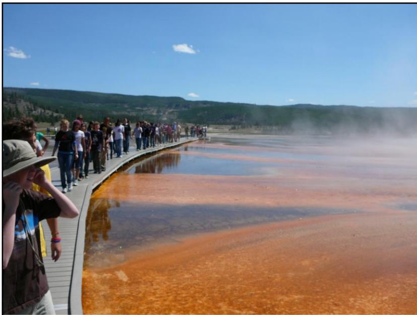
Grand Prismatic Hot Spring

included visiting a Wolf and Bear Rescue facility, wading in the Nez Perce River, seeing the unmatched color explosion of Grand Prismatic Hot Spring and Excelsior Geyser, watching Old Faithful honor its name with an 140-foot fountain of boiling water, smelling the odiferous omissions from mud pots, eating lunch while appreciating why the spot is called Artist's Point, descending to the base of the Lower Falls of the Yellowstone River, exploring the interactive geologic exhibit on Yellowstone, ogling elk and bison from the safety of the bus, and