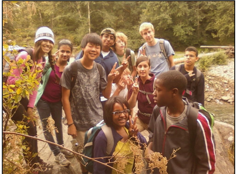
On the boulder at Goblins' Gate.

Our trips to national parks provide the wonderful opportunity to learn science in the field, to develop leadership skills, to view awesome natural beauty, to see wildlife in their habitat, and to foster new and renewed friendships. The enthusiasm that our students express during discussion of geology or biology topics, debating environmental issues, performing the chores of preparing meals and cleaning after the meal, hiking to view unique sights, watching a marmot or bighorn sheep return the curiosity, and talking (seemingly without end for several days) to their friends refreshes all of the sponsors.